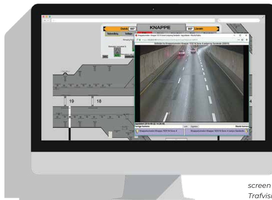
screen image from Trafvision showing integration of cameras

These factors make Trafvision a cost-effective, safe and future-proof system that can be developed in line with the customers' specific requirements.